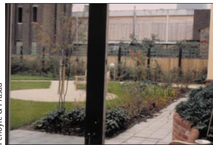
A garden "wandering path," seen from the internal safe wandering route, at Woodlands Nursing Home in Lambeth, London.

Wells-Thorpe described mental health care facilities in which architects addressed problems that patients